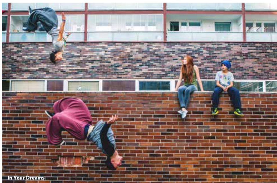
In Your Dreams