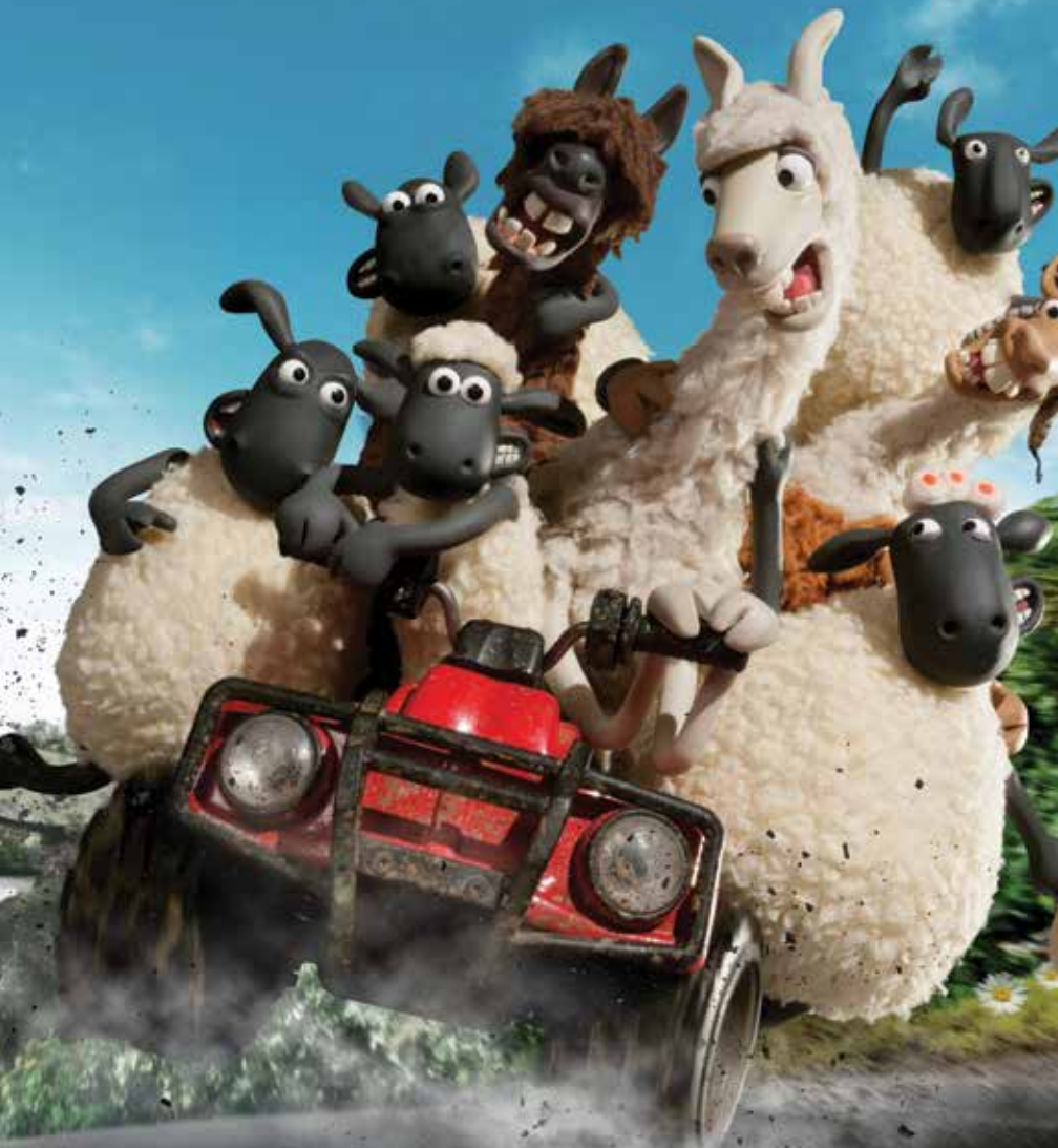
Shaun the Sheep